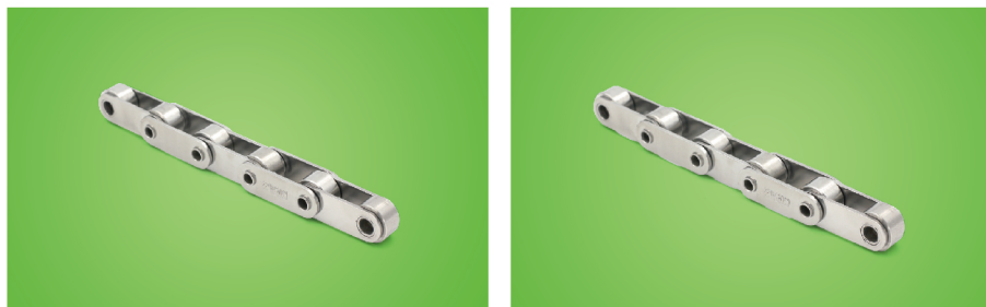
Hollow Pin Chain C Style