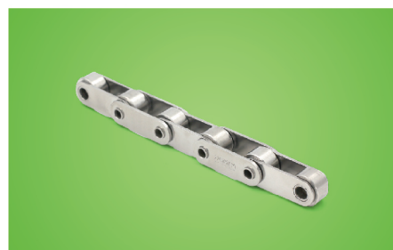
Hollow Pin Chain A Style